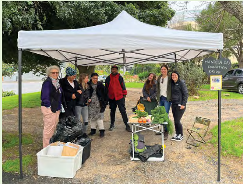
Braving the cold during our Mandela Day donation drive in 2023.

The peer outreach team works across the City Bowl (outside of the area covered by the CCID in the central business district), including Devil's Peak and Vredehoek.